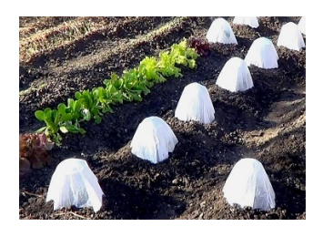
Hotkaps made of waxed paper will last one season