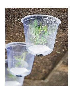
Cloches made of plastic or glass protect plants and last several seasons.