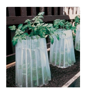
Wall-o-water freestanding tower of tubes filled with water. Sun during the day heats the water to warm plants overnight.