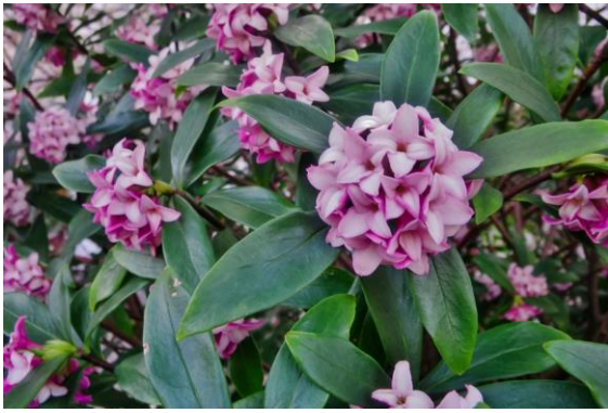
Daphne odora (Winter Daphne)